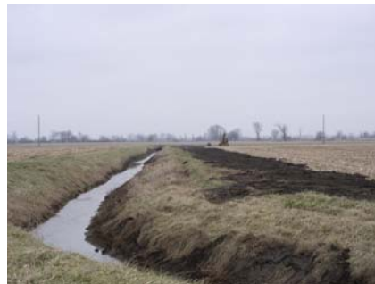
Mott-Spahr Dip out